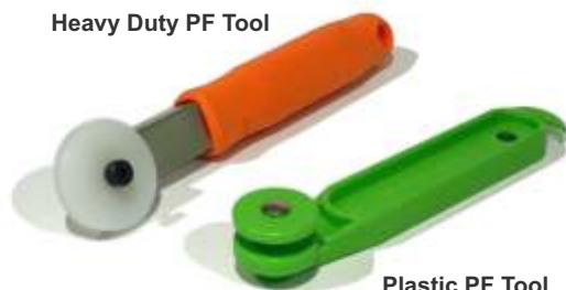
Heavy Duty PF Tool