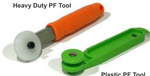
Plastic PF Tool